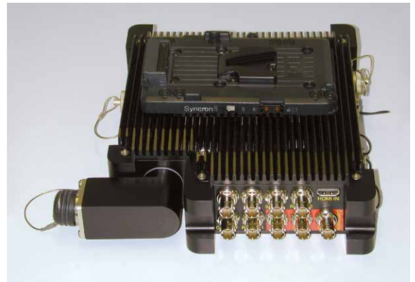
HD Z-Link camera side