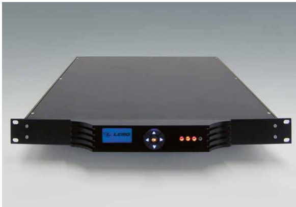
HD Z-Link CCU side